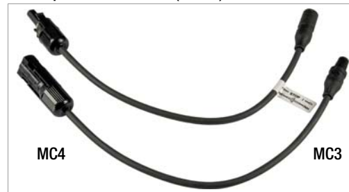
PV Adapter Set MC3-MC4 (Z360K)